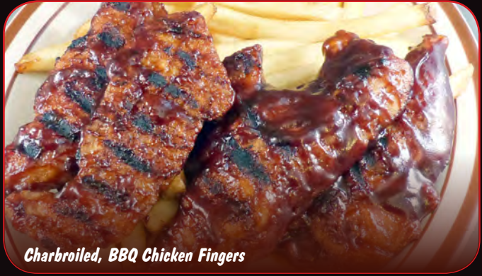
Charbroiled, BBQ Chicken Fingers

Hot Roast Beef or 1/2 lb. Meatloaf..... 11.00 Served on White Bread w/Gravy and choice of mashed potato or french fries