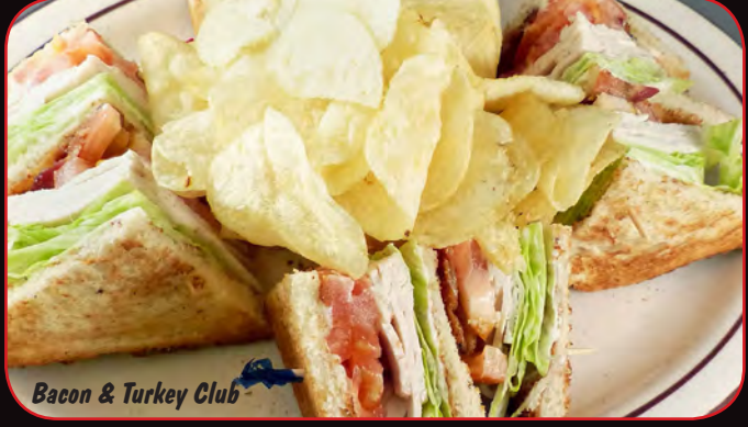
Bacon & Turkey Club