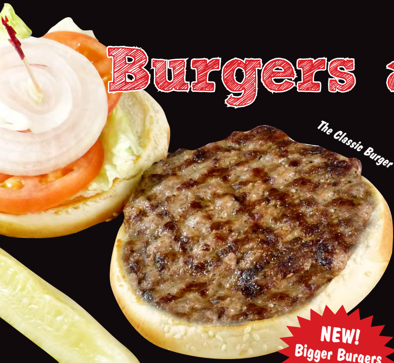
The Classic Burger