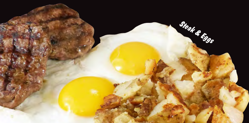
Steak & Eggs