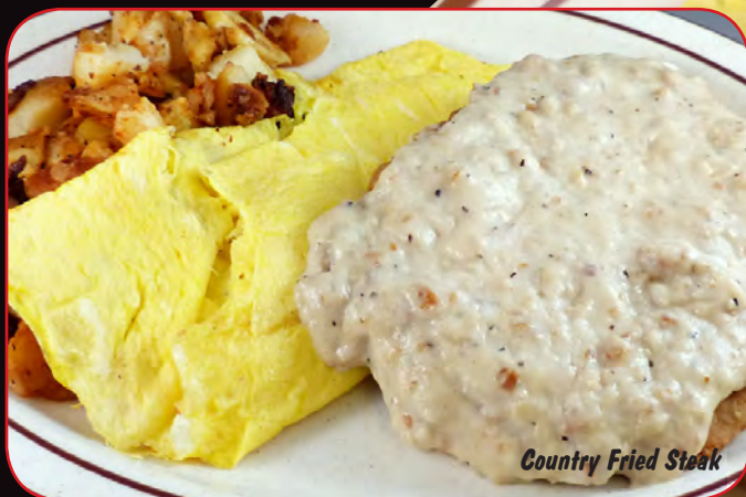
Country Fried Steak

Classic Eggs Benedict – two poached eggs over top of Canadian bacon, sausage or apple smoked bacon on an English muffin. Drizzled with hollandaise sauce. Served with home fries. ....13.00