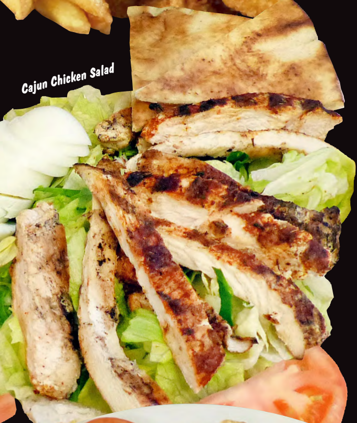
Cajun Chicken Salad