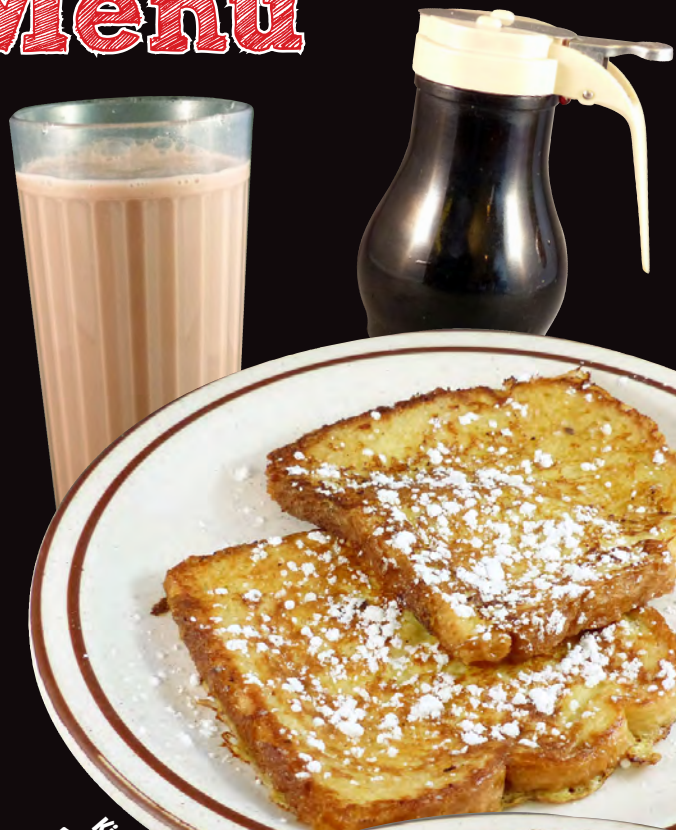
Kiddie French Toast