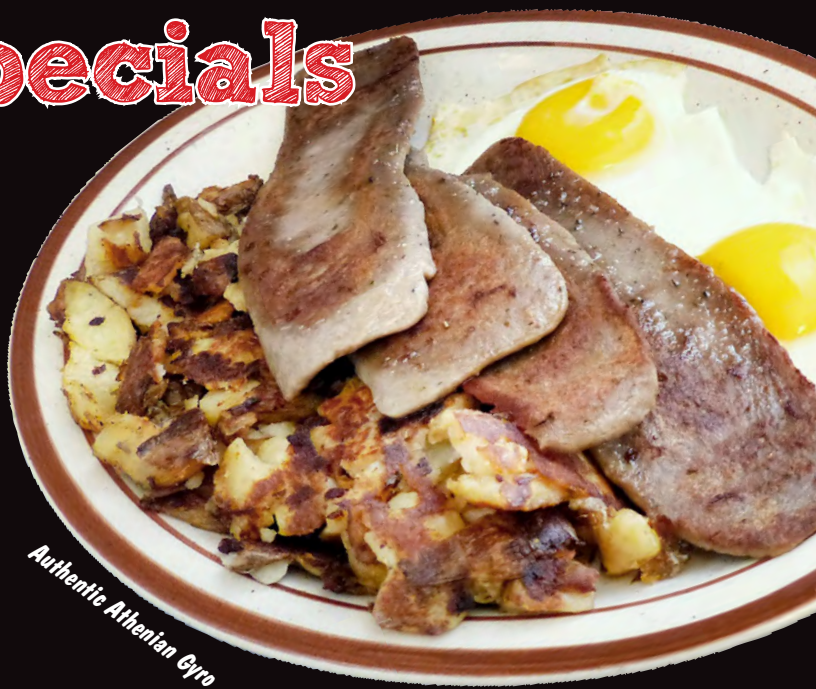
Authentic Athenian Gyro