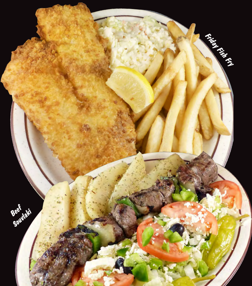
Friday Fish Fry