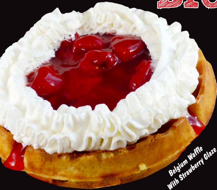
Belgium Waffle With Strawberry Glaze