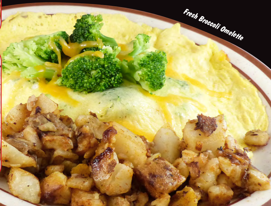
Fresh Broccoli Omelette

Ask Your Server for the Specialty Omelette of the Week! Served with your choice of two pancakes, two slices of French toast or home fries and toast.