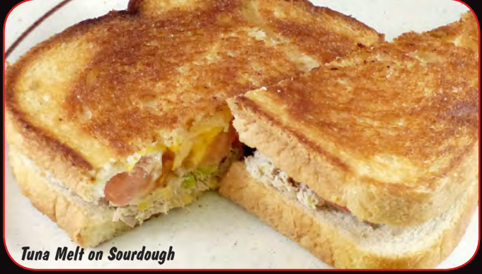
Tuna Melt on Sourdough