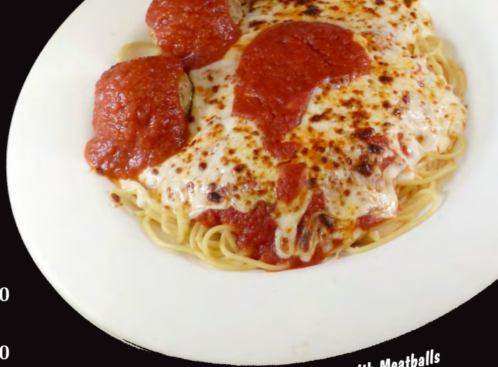
Spaghetti with Meatballs