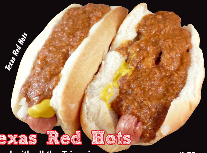
Texas Red Hots

Kincaid-Triple Decker – turkey, swiss cheese and coleslaw grilled lightly together with thousand island dressing on rye bread. Served with coleslaw, potato salad or potato chips and pickle ..... 12.00