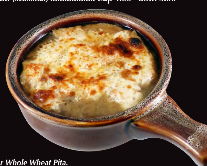
French Onion Soup